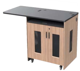
PD51 with 5101TP-L Top