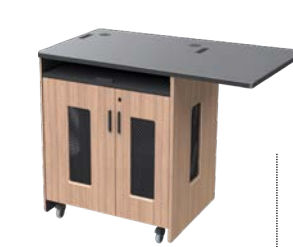
PD51 with 5101TP-R Top