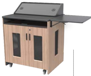
PD51 with folding shelf