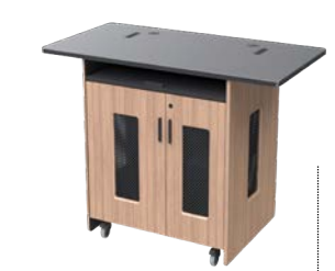
PD51 with 5102TP Top (Folding side shelf cannot be used along with 5102TP Top)